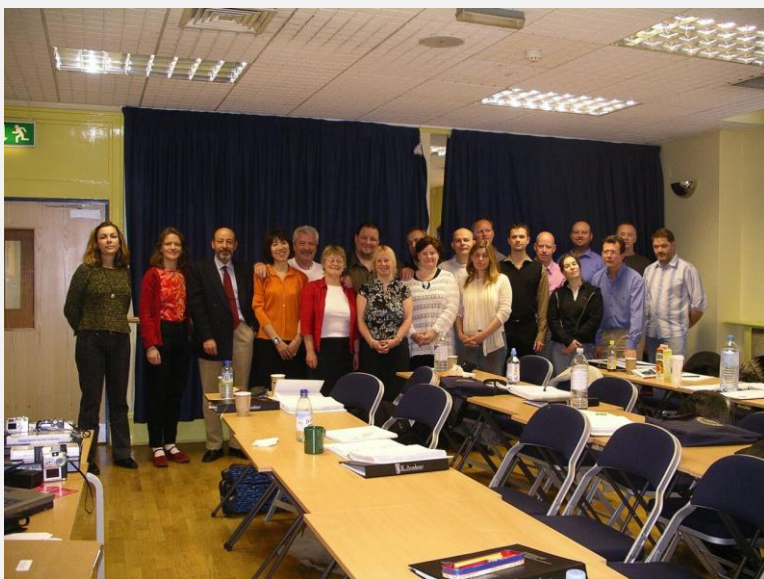
The International Certified Professional Instructor course

Both the Practitioner and Master Practitioner Courses are stand alone courses in their own right, but the Practitioner Course is also contained within the Diploma in Clinical and Advanced Hypnosis.